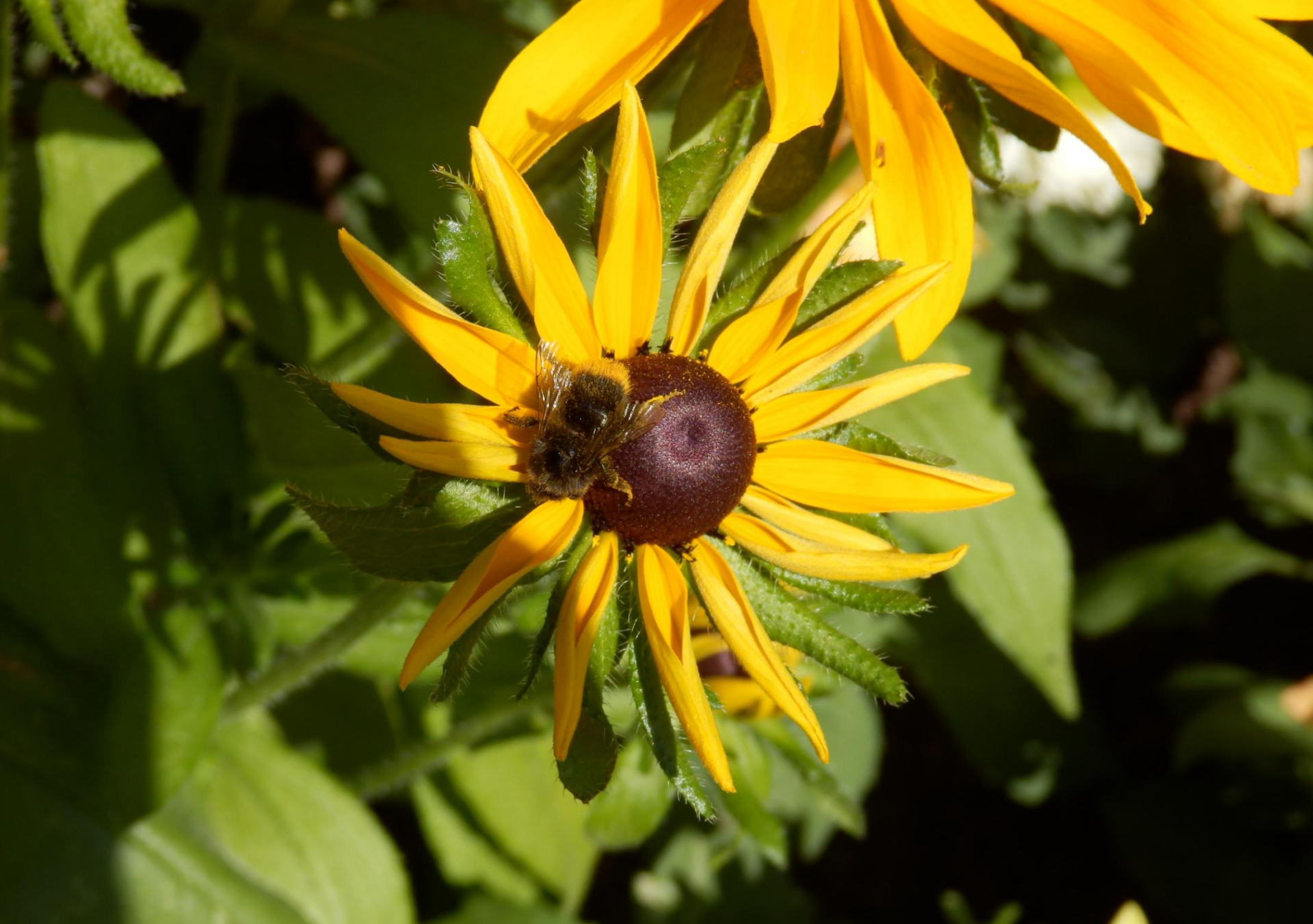
A bee-friendly rudbeckia