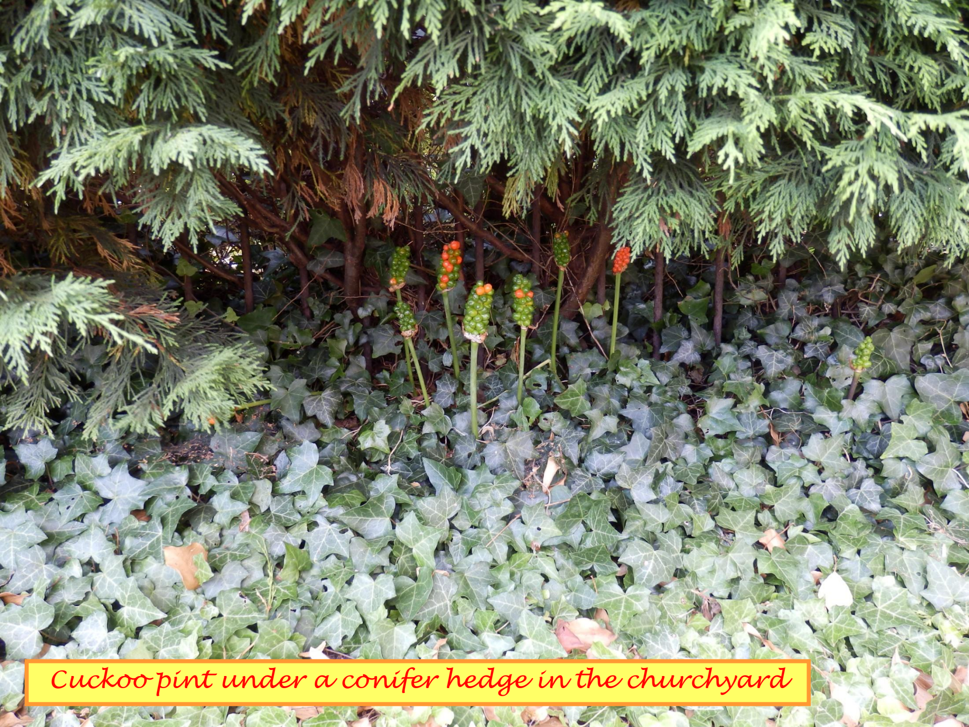
Cuckoo pint under a conifer hedge in the churchyard