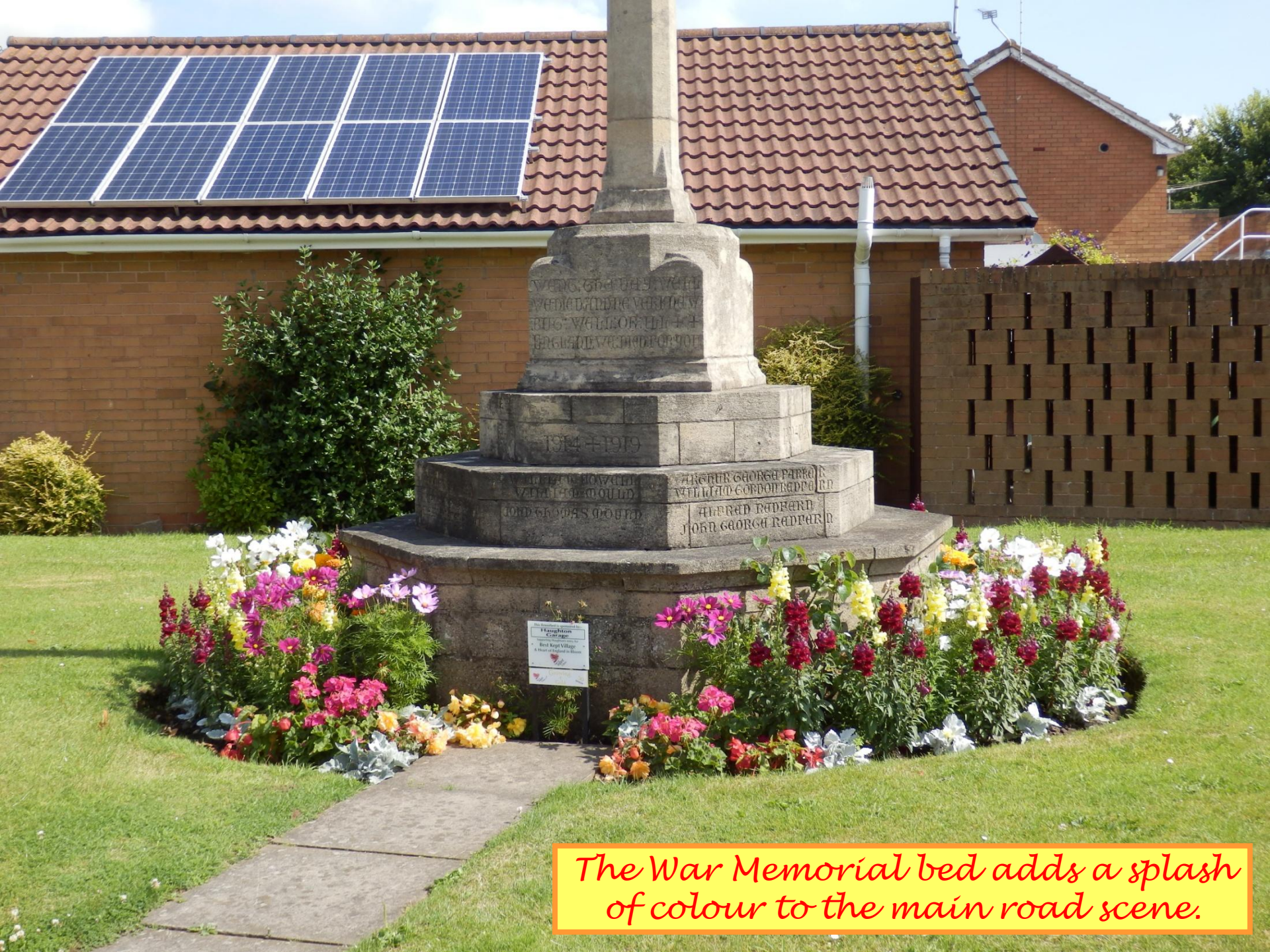
The War Memorial bed adds a splash of colour to the main road scene.