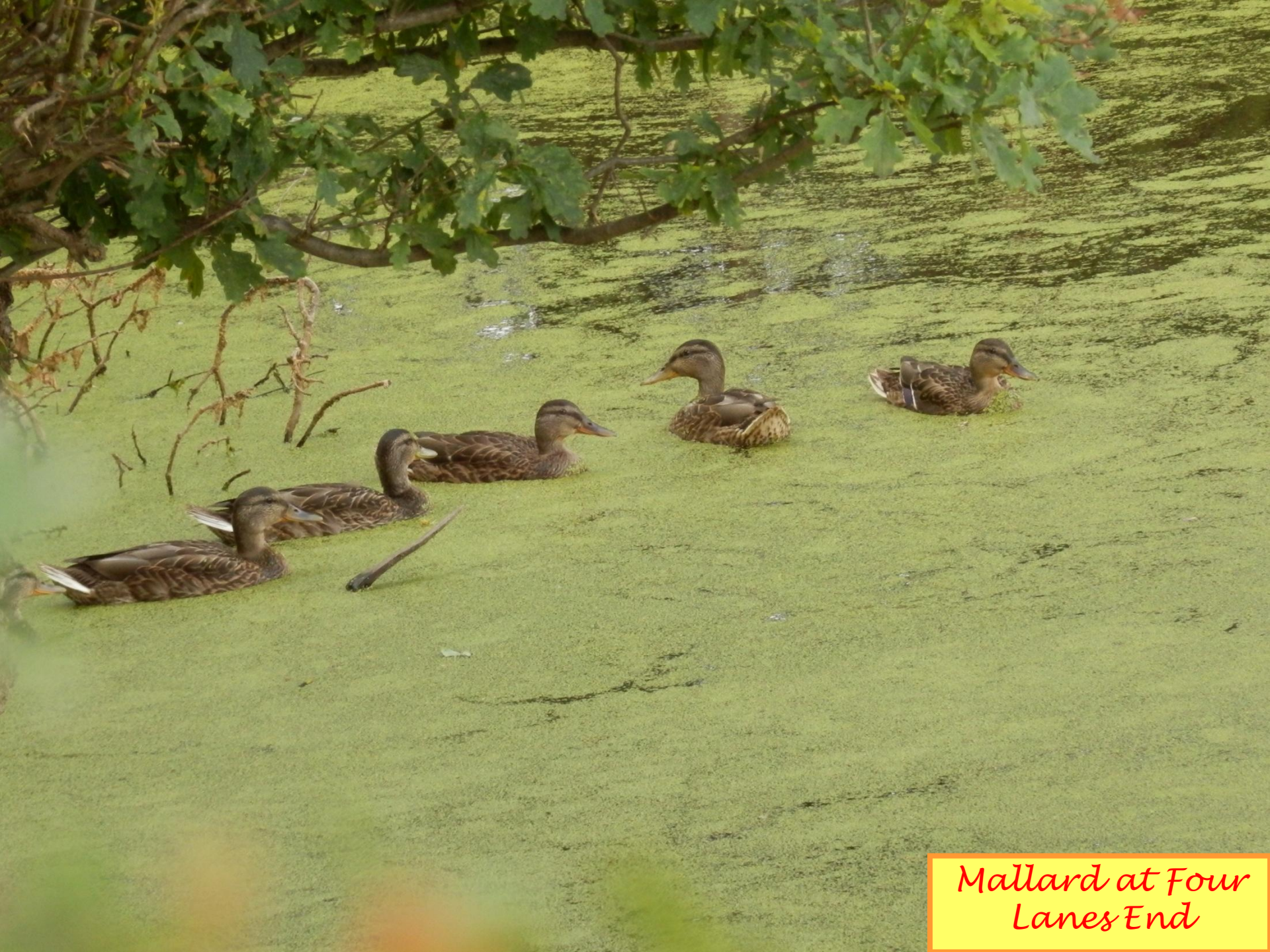
Mallard at Four Lanes End