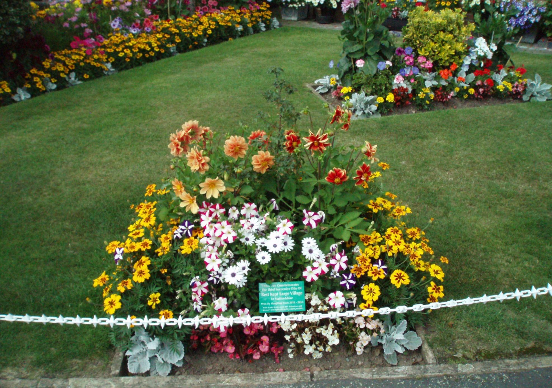
BKV prize tree and surrounding border in a garden setting.