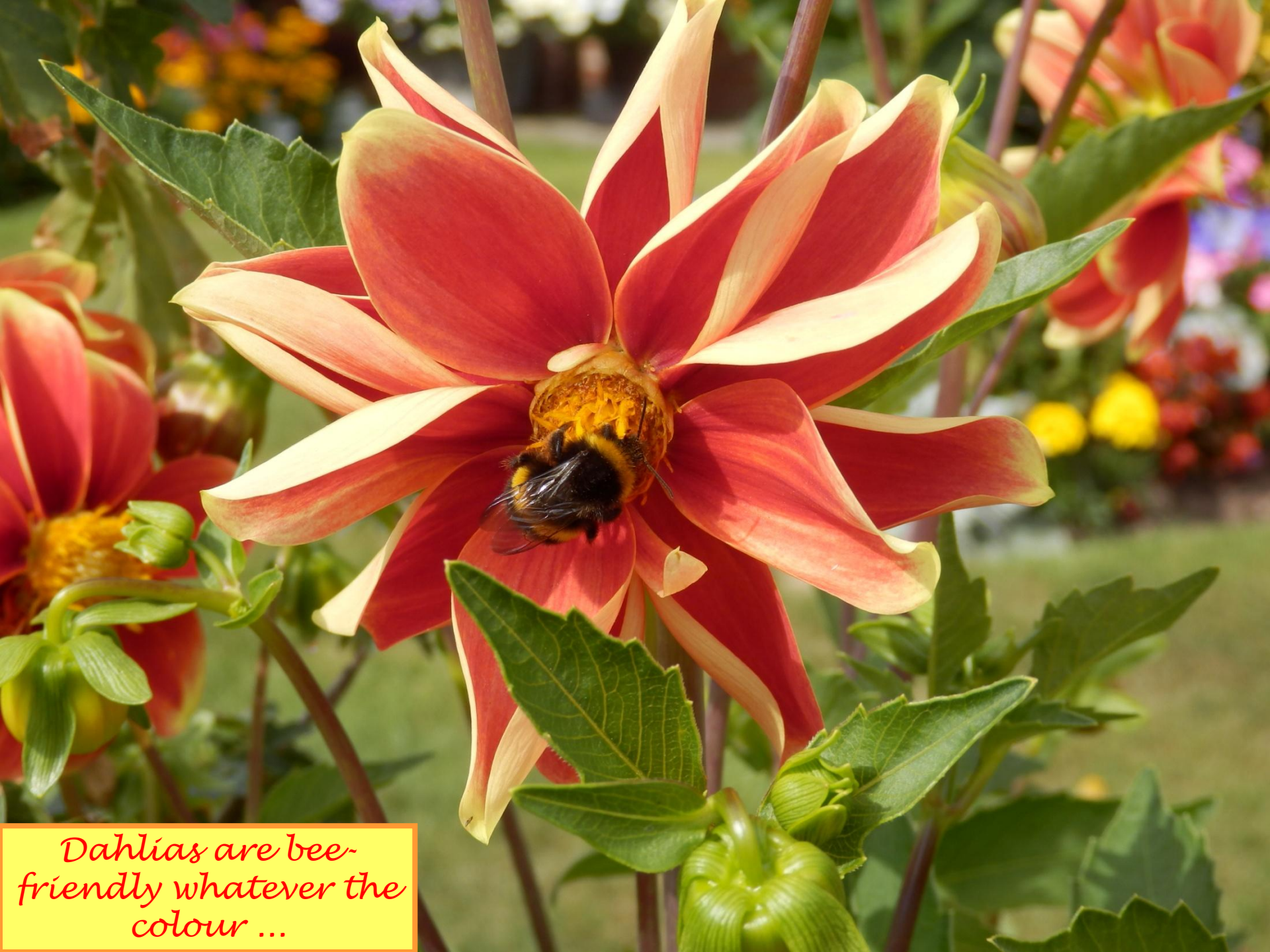
Dahlias are bee-friendly whatever the colour ...