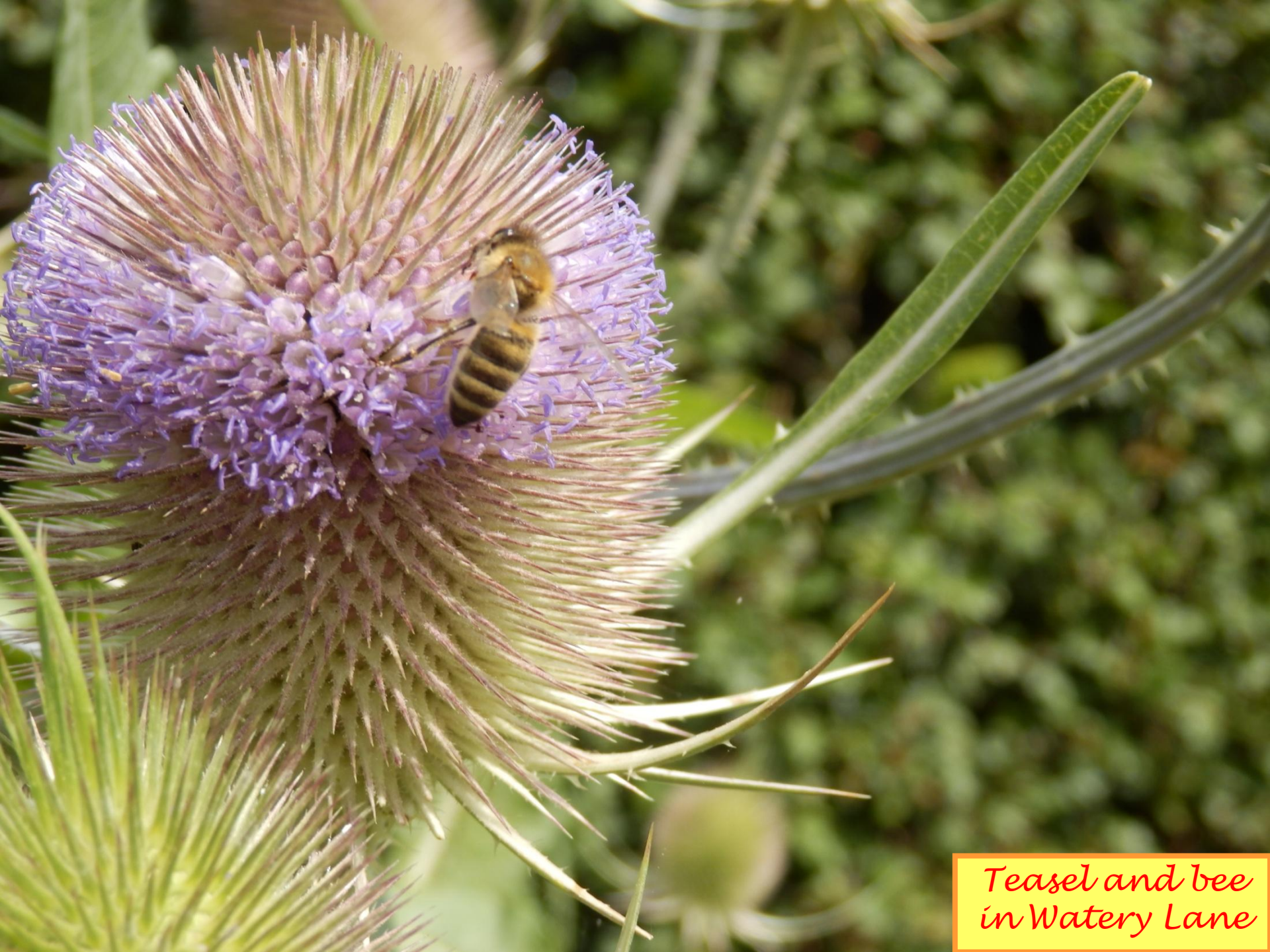
Teasel and bee in Watery Lane